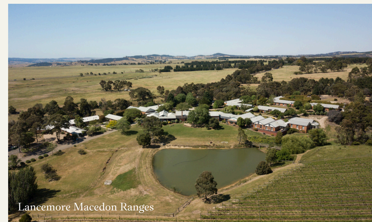
Lancemore Macedon Ranges