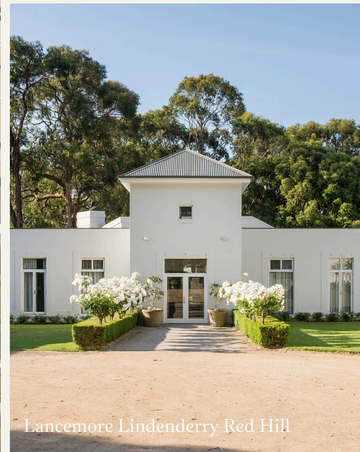
Lancemore Lindenderry Red Hill