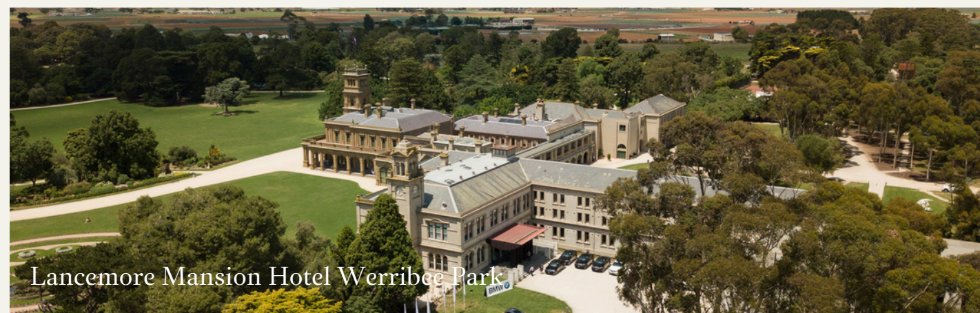
Lancemore Mansion Hotel Werribee Park