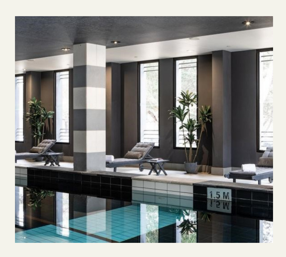
FOLLOW US ON: O lmspa_