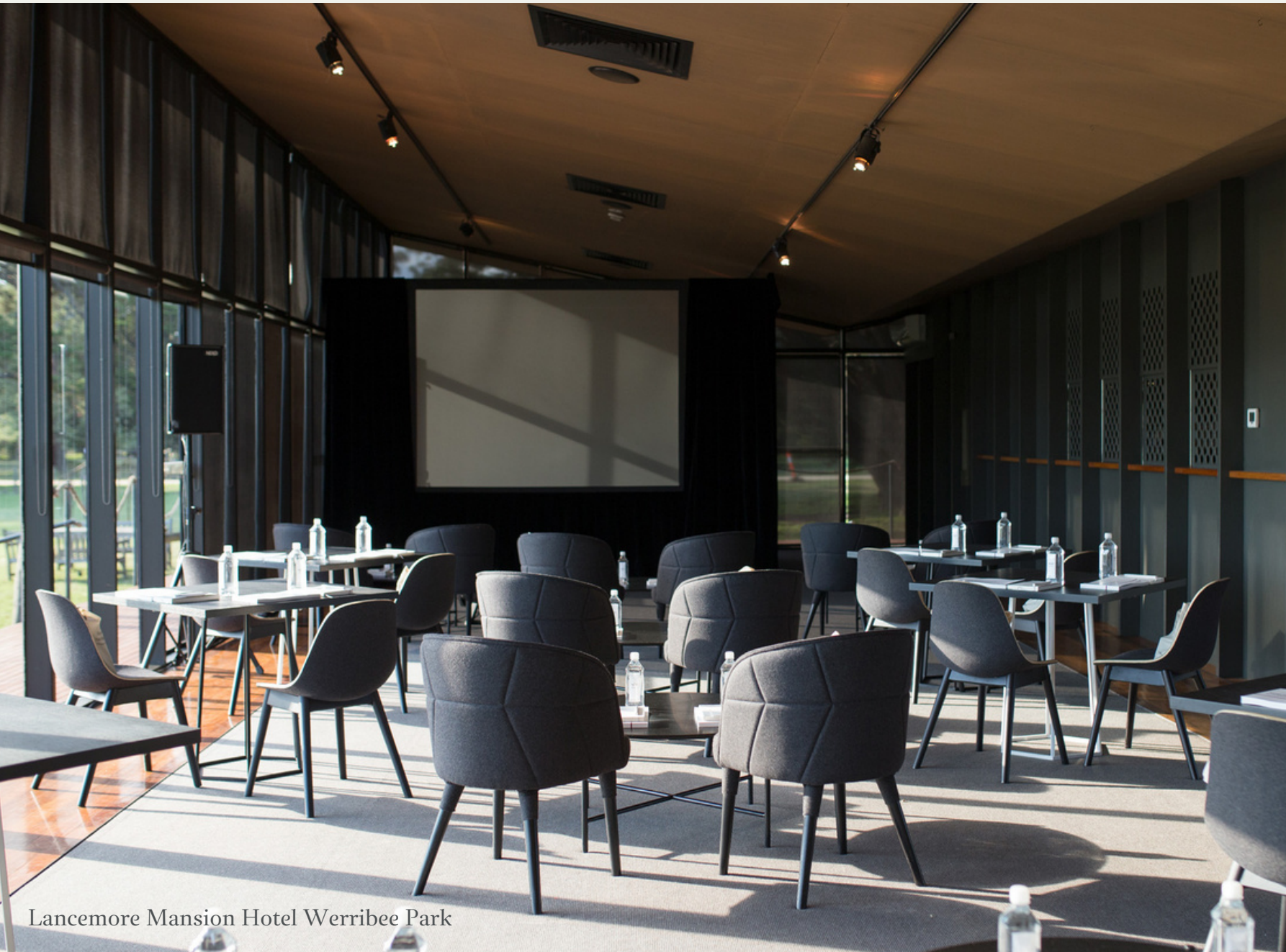
Lancemore Mansion Hotel Werribee Park