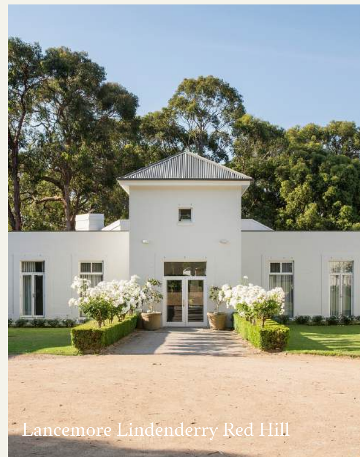
Lancemore Lindenderry Red Hill