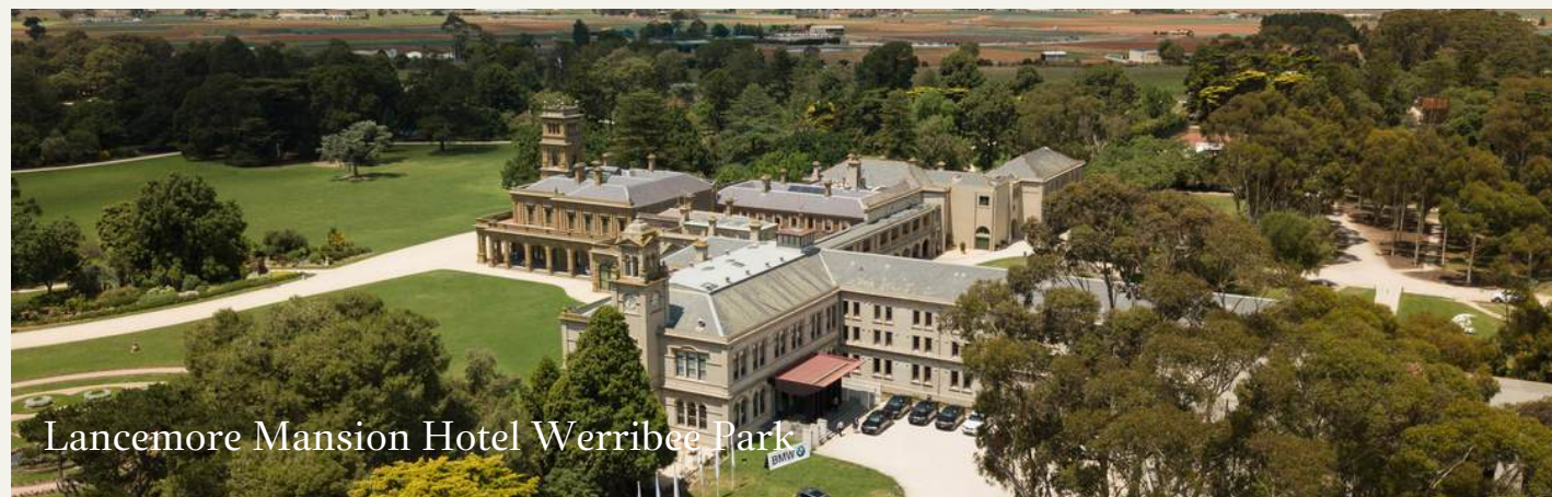
Lancemore Mansion Hotel Werribee Park