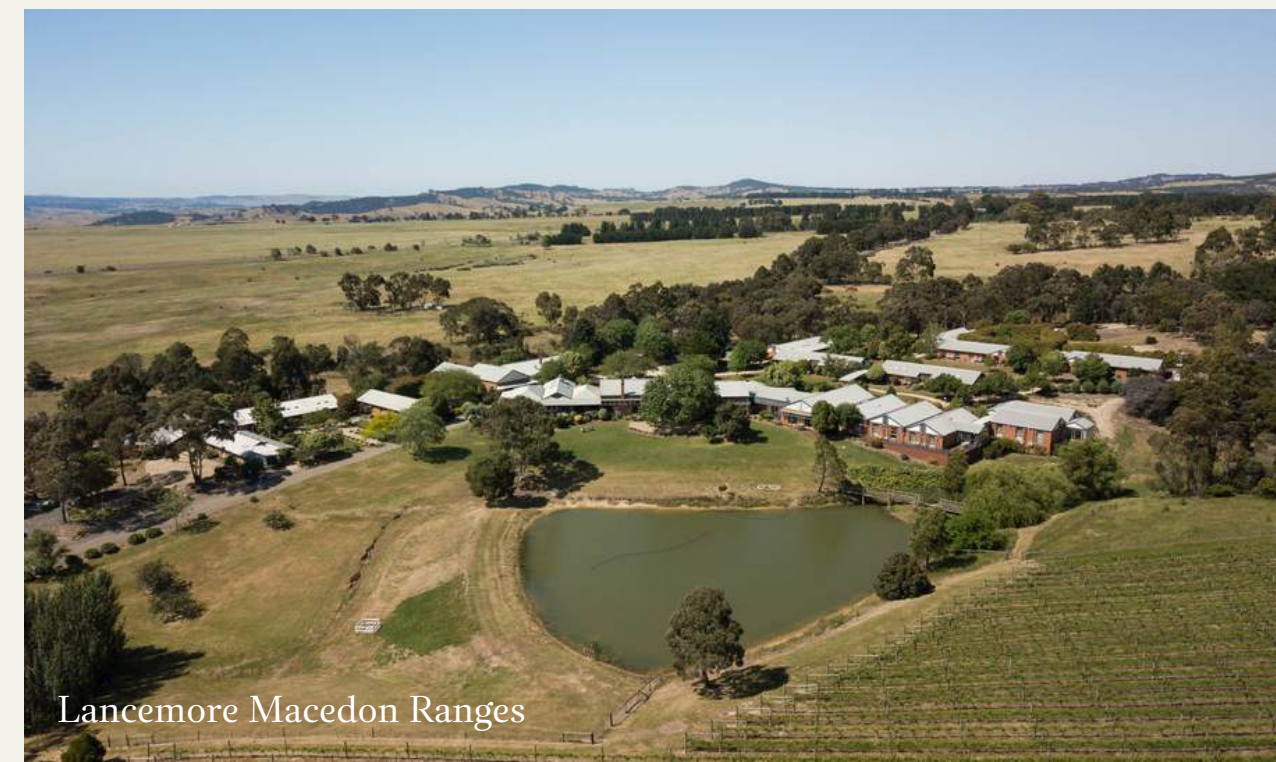
Lancemore Macedon Ranges