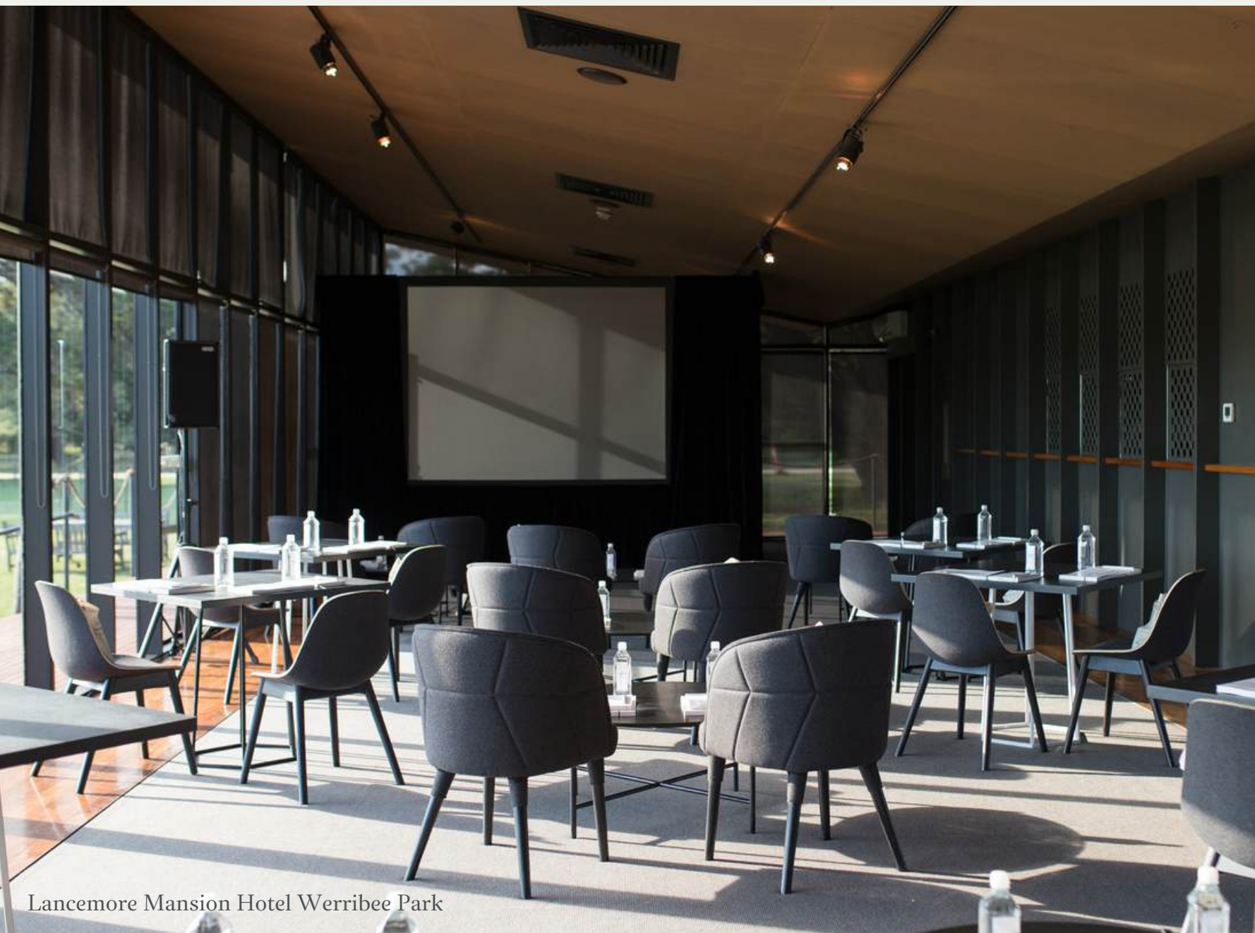
Lancemore Mansion Hotel Werribee Park